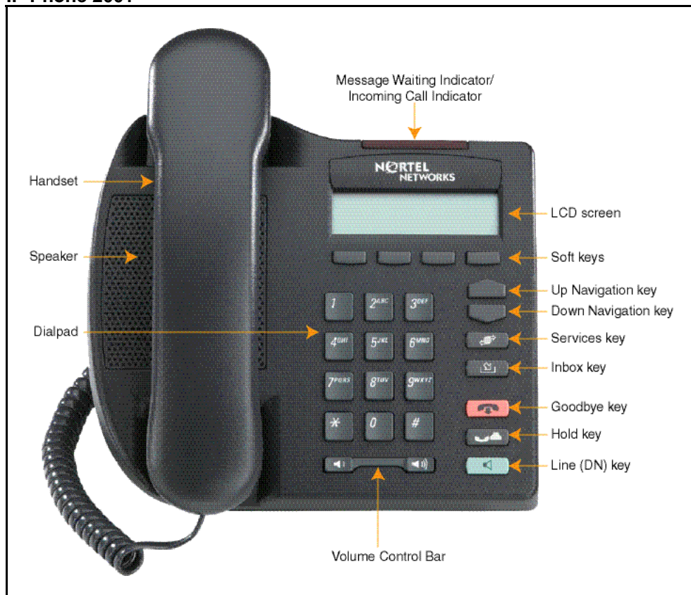
Figure 1 IP Phone 2001