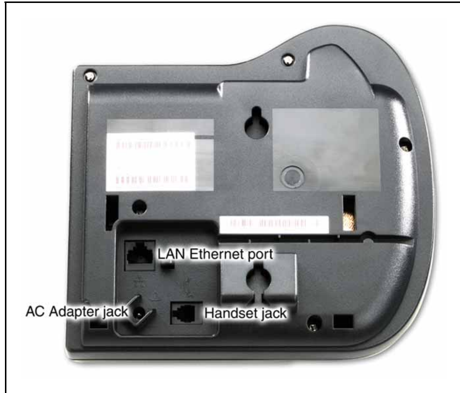
Figure 4 IP Phone 2001 connectors

This figure shows the location of the connectors on the back of the IP Phone 2001 terminal.